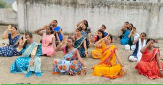
Sakhi Mandal women promoted the theme 'Yoga for Self and Society' by conducting rallies, yoga sessions

Recognizing yoga's vital role in fostering a happy and healthy life, Palash (JSLPS) organized various programs at village, cluster, and block levels across the state. These initiatives aimed to highlight the importance of yoga practice, engaging local residents, rural women from Sakhi Mandal, school students and trainees from DDUGKY and RSETI. Sakhi Mandal women promoted the theme 'Yoga for